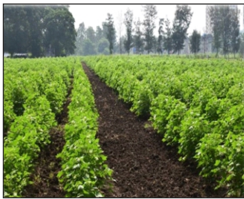
(1) MCRS, Surat

The survey was conducted in the major cotton-growing districts of Guntur, Krishna, and Prakasam of Andhra Pradesh. The intensity of Corynespora leaf spot disease was observed 15 and 12 percent in Akira and RCH 659 in Krishna district. The average highest PDI 21.3 percent, 11.07 percent and 7.7 percent of Corynespora leaf spot was recorded in Krishna, Guntur and Prakasam districts [3]. The survey was conducted in major cotton-growing districts of Bhavnagar, Rajkot and Junagadh of Gujarat, 2021. In mid-season, the PDI of Corynespora leaf spot (CoLS) was observed in the range of 0.0-10.5 percent. Whereas, in the late season, PDI of the Corynespora leaf spot disease (CoLS) was recorded in the range of 15.0-55.2 percent [4]. Whereas, in the late season, PDI of the Corynespora leaf spot disease (CoLS) was recorded in the range of 15.0-55.2 percent [4].