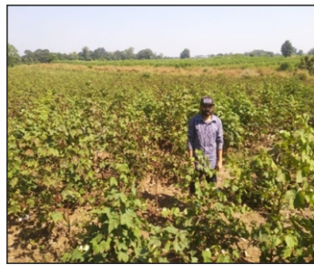
(2) Modaliya, Bharuch