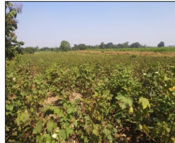
(3) Dediypada, Narmada