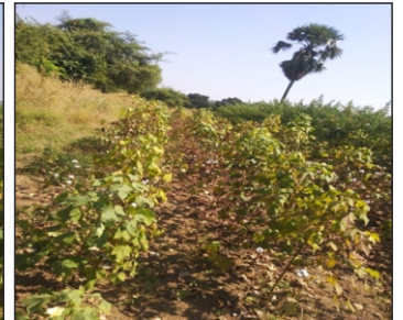
(4) Sagbara, Narmada